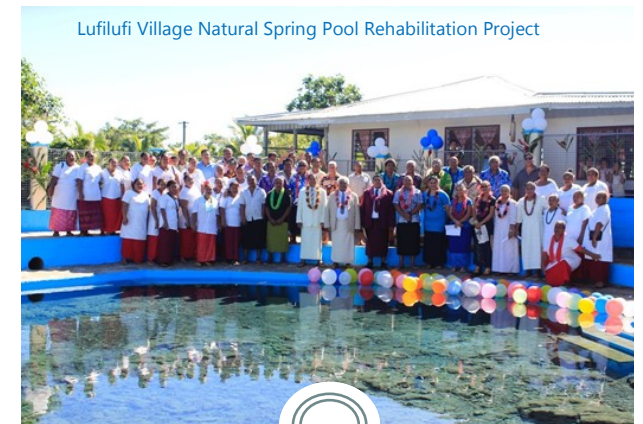
Lufilufi Village Natural Spring Pool Rehabilitation Project