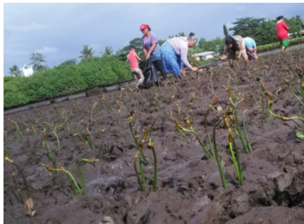
Mangrove rehabilitation through replanting atand identified degraded area by the Komiti Tina Vailoa Faleata