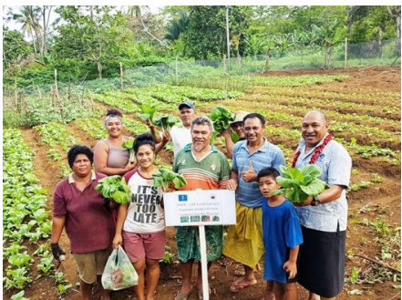
Taumafai Society Magiagi showcasing their organic produce at their farm with SGP staff