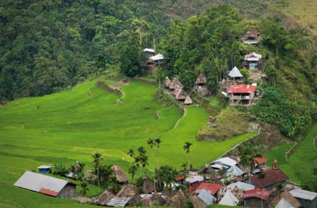
Rice terraces, The Philippines