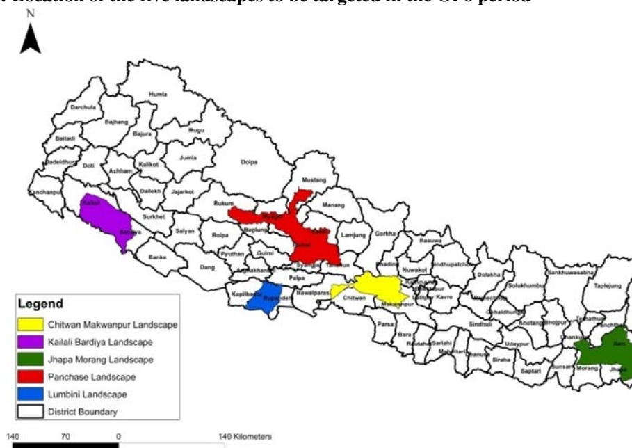
Table 3: Landscapes selected for implementation of GEF SGP projects in the OP6 period