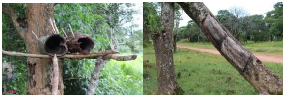
Plate 2: Bee hives made from bark of trees

braked for making bee hives are mainly J. paniculata and Brachystegia spiciformis . So far, Forest Fruits Company stated that they have a total of 5000 bee keepers with each keeper having an average of 200 traditional bark hives. The traditional technology of bee hive making using tree barks poses a great challenge for the forests. Beekeepers in debarking the trees to make hives eventually kill the trees.