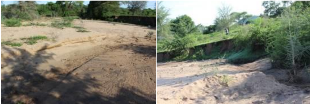
Plate 4: Gully erosion in Sinazongwe Area of Lower Zambezi

chances of erosion. Gully erosion and the erosion of stream and river banks is a common sight.