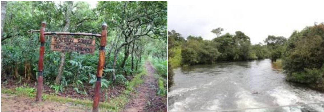
Plate 1: Zambezi River and its source in Mwinilunga North - Western

Less impact existing on the water bodies. The source of the Zambezi River is still intact with rich and dense forest. The tributaries Lunga and Lwakela are very active and well covered with vegetation. The river crosses into Congo and Angola. Fishing activities are not significantly noticeable. Not many activities exist so far along the river. Maintaining the river catchment in order to prevent the disruption of the hydrological regime is very important.