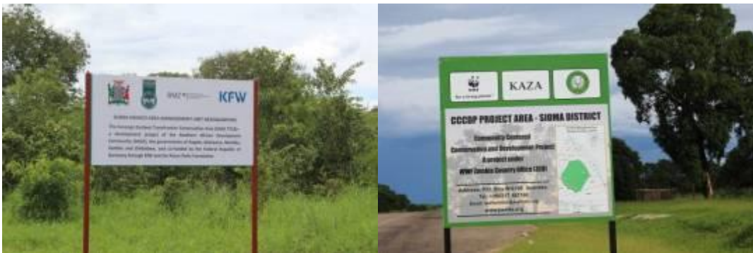
Plate 3: KAZA project areas in Sioma district in Western province

The KAZA project is a transboundary project in wildlife management for Namibia, Mozambique, Angola, Botswana Zimbabwe and Zambia. The Community Partnership Park Model. KAZA, is operating the Sioma National Park, the approach is based on recognizing partnership the government, private sector and the community. Out of this initiative a park headquarters for Sioma Ngwezi has been built and is fully functional. With the construction of the Kazungula Bridge and operationalization of the KAZA Transfrontier Conservation Area, the park has a great potential for tourism development The Sioma National Park has created a conservancy with the community to manage wildlife. The Community Resource Boards (CRBs) comprising village members in the surrounding area. Village Action Groups (VAGs) formed in each of the villages are responsible for monitoring and conserving natural resources. Natural resources monitored include forestry products and wildlife.