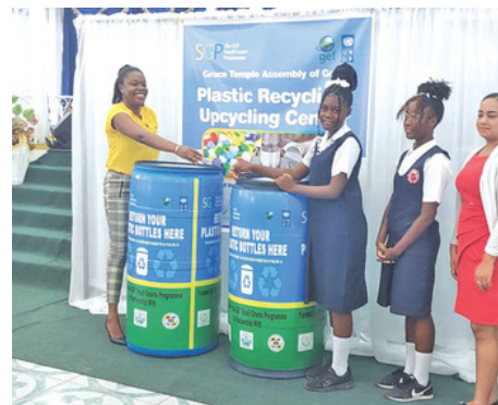
Handing over plastic receptacles by the GEF SGP Guyana National Coordinator to one of the participating schools under the Grace Temple Assembly of God plastic recycling project. Officially launched May 2023