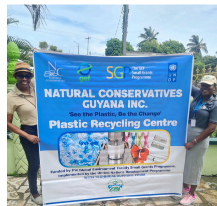
Natural Conservatives Guyana Inc. project banner