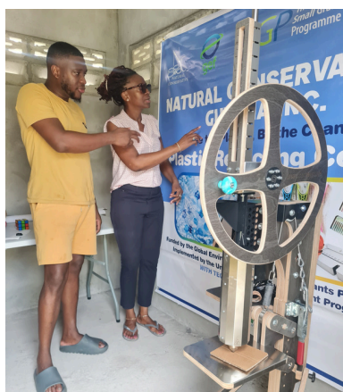
Members of the Natural Conservatives Guyana Inc.