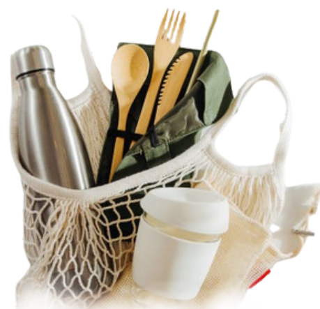
Alternatives to plastic products: Reusable cloth bags, wooden cutlery, reusable bottles and cups, metal straws

Source of information- articles published by: The Office of the President – Cooperative Republic of Guyana, The Environmental Protection Agency (EPA), The Guyana National Bureau of Standards (GNBS)